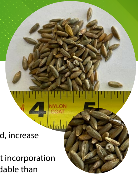
Cereal Rye Seed