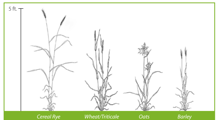
Cover crop grass growth comparison