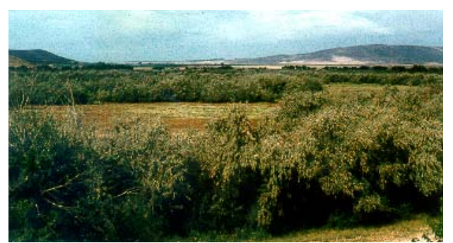
Russian-olive replaces native cottonwood and willow stands in wet saline bottomlands. Once established, Russian-olive stands are very stable.

Russian-olive and saltcedar ( Tamarix pentandra Pall.) are particularly troublesome in western riparian areas (Christiansen 1962, - 1963, Carman and Brotherson 1982). Several of the larger nurseries that produce trees and shrubs for the conservation market have removed Russian-olive from their sales lists. Russian-olive is not listed on the Federal Noxious Weed List. New Mexico and Colorado are the only states currently listing it as legally noxious (based on PLANTS.usda.gov information and G. Beck comm., respectively). Utah has also listed it as a noxious weed in several counties.