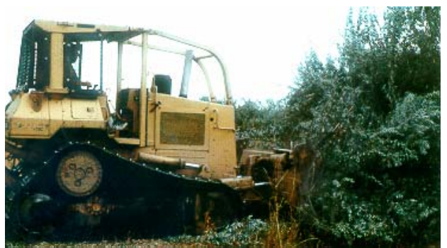
Dozing of Russian-olives near Richland, WA. Severed top growth was piled and burned. Soil disturbance was considerable.

<u>Disadvantages</u>: A skilled operator is needed. Followup treatment will be required to control root sprouts. The spoil material must be dealt with by piling and/or burning. Burn permits may be needed and difficult to obtain. Dozing can be indiscriminant, causing damage or mortality to desirable species. Dozing leaves the soil bare and prone to erosion and weed invasion. Soil compaction and profile disturbance frequently occur, and complicate reclaiming the site.