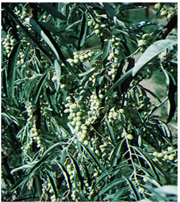
Birds and mammals readily eat Russian-olive fruit. Each fruit has a single seed in the center.

Russian-olives grow well in uplands that receive as little as 8 inches of mean annual precipitation (Laursen and Hunter 1986), and consequently, it was commonly included in multi-species windbreaks and shelterbelts throughout the West. Rocky Mountain juniper ( Juniperus scopulorum ) and Siberian peashrub ( Caragana species) are equally as drought tolerant.